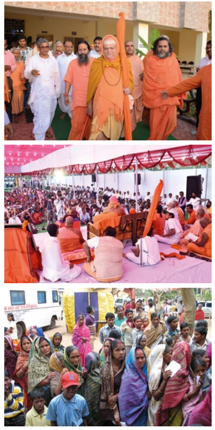
Photos taken at the opening ceremony of the HCHC Day Clinic in Jagatpur on 14 February 2014.

In 1999, the small Hariharananda Charitable Health Centre (HCHC) in Cuttack started providing patient care. In 2014, this beneficial era came to an end and a new one began just a kilometre away: The first patients already filled the new HCHC Day Clinic in Jagatpur on its opening day, on 14 February. The Clinic – a three-storey building – was planned well in advance, and then built in record time as soon as the required funds had been raised. Only 15 months after the groundbreaking ceremony, more than 800 people celebrated the opening of the new Health Centre as "God's gift to the poorest of the poor". Among the guests were spiritual and respected Odisha personalities from political, academic, and medical backgrounds.