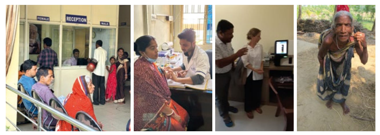
Many people wait here for the results of their X-rays or blood tests. Fortunately, both have been possible here on site for several years now.

ary 2020. The fact that X-rays and blood tests can now also be done at the HCHC, is crucial for diagnostics. For many people, who often come on foot and from distant regions of Odisha, this service is what makes in-depth treatment possible in the first place - and because all is free of charge for those in need.