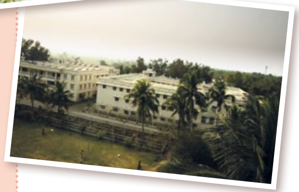
In 20 years, Balashram has grown into an impressive campus. To date, 922 children have found a home there, 244 have already moved out into the world, and 121 came to the first alumni reunion.