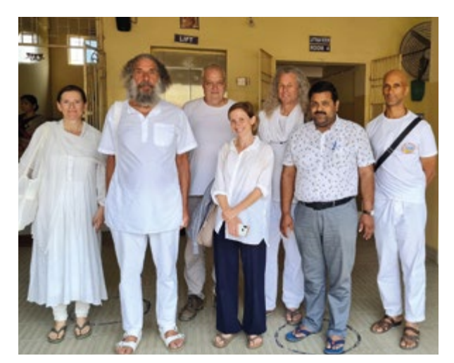
Members of HAND IN HAND Austria, France, the Netherlands, and Switzerland with the Manager of Jagatpur HCHC in the entrance area.

For example, important analysis equipment that can measure up to 300 parameters within 10 to 20 minutes, as well as hardware and software for documenting medical histories. And, in the spring of 2020, the long-awaited radiology service started operating as well.