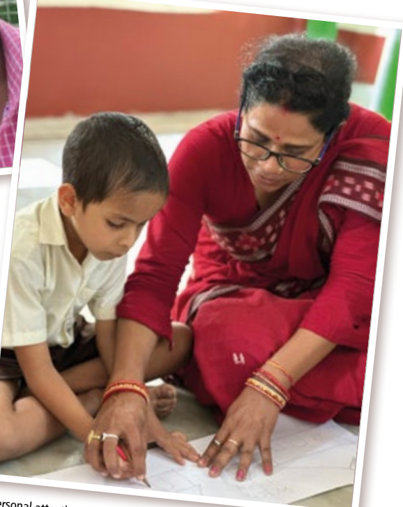
Personal attention and individual support are of central importance at Balashram.

Personal attention and individual support are thus considered essential for the children's happiness. "Especially during the early days, personal, individual care is so important. We need to talk a lot with the children and be very patient with them," emphasised the Vice-Director.