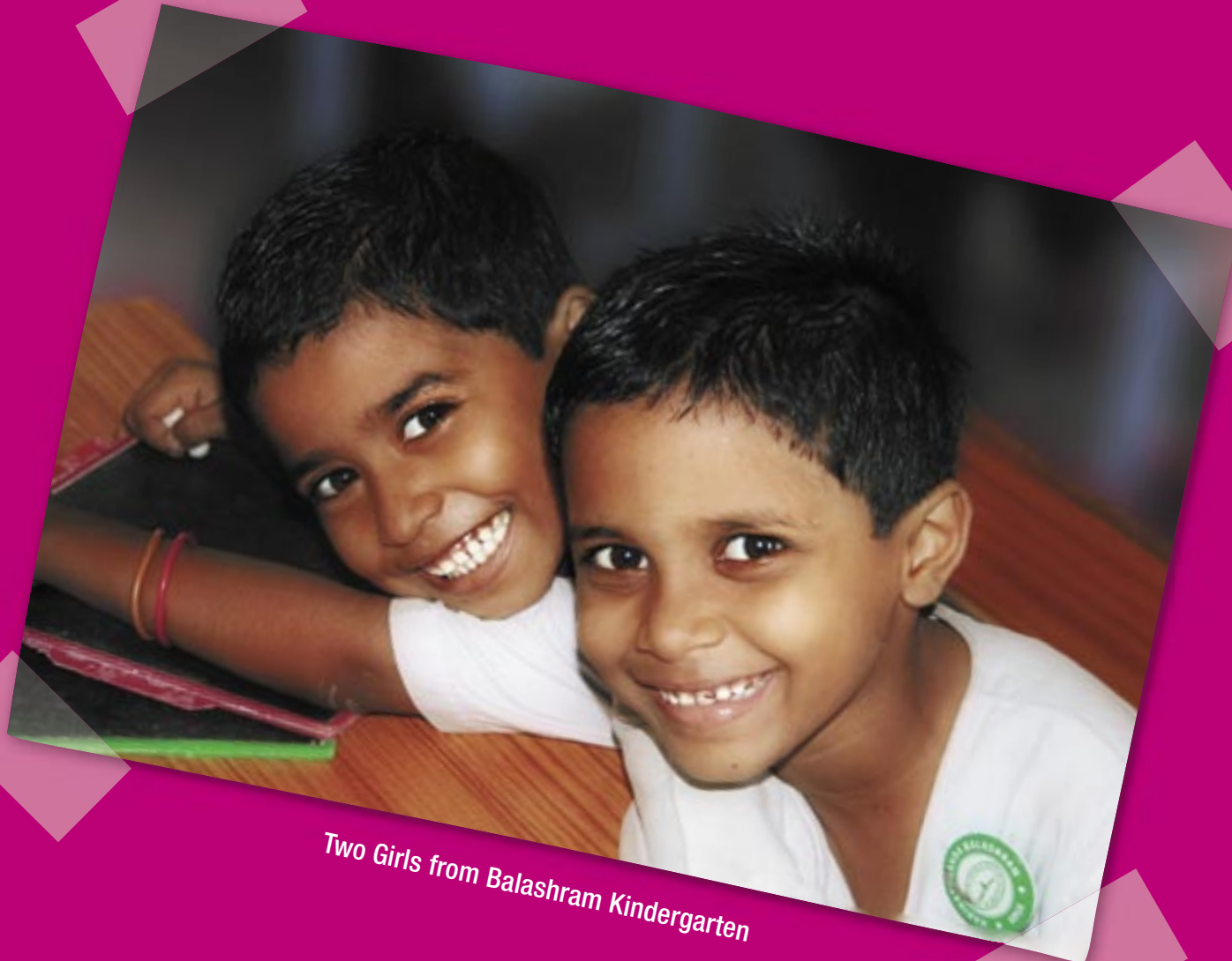
Two Girls from Balashram Kindergarten