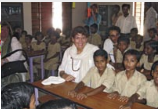
ADULTS were able to sit on school benches again during the inauguration of the school library