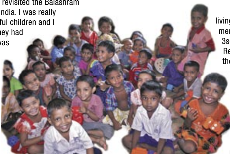
THE NURSERY CLASS of 2007

A couple of weeks ago I revisited the Balashram Residential School in India. I was really happy to meet the joyful children and I marvelled at the progress they had made since my last visit. I was particularly moved by the new entrants – 40 boys and girls - who have been attending the preschool class (nursery) since April 2007. Like their older schoolmates these children come from very poor families. Some are semi-orphans, some are orphans, and others were