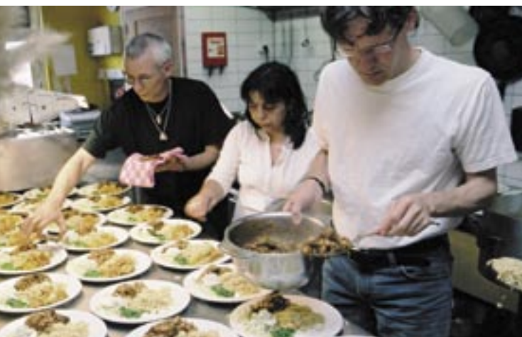
DINNER IN ROTTERDAM: the first fundraising event of HAND IN HAND NETHERLANDS